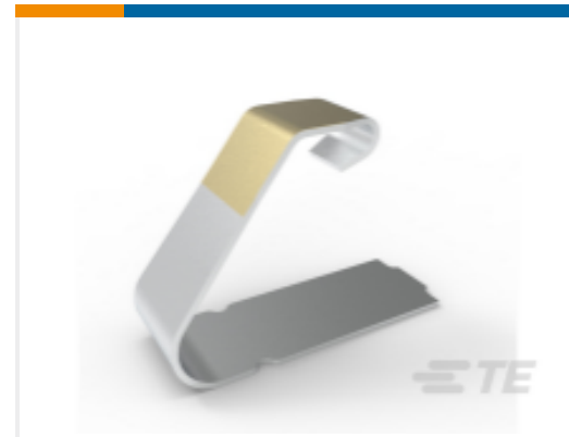
TE Part # 440423-1 Shield Finger 5025